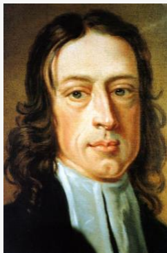
John Wesley (1703-1791)